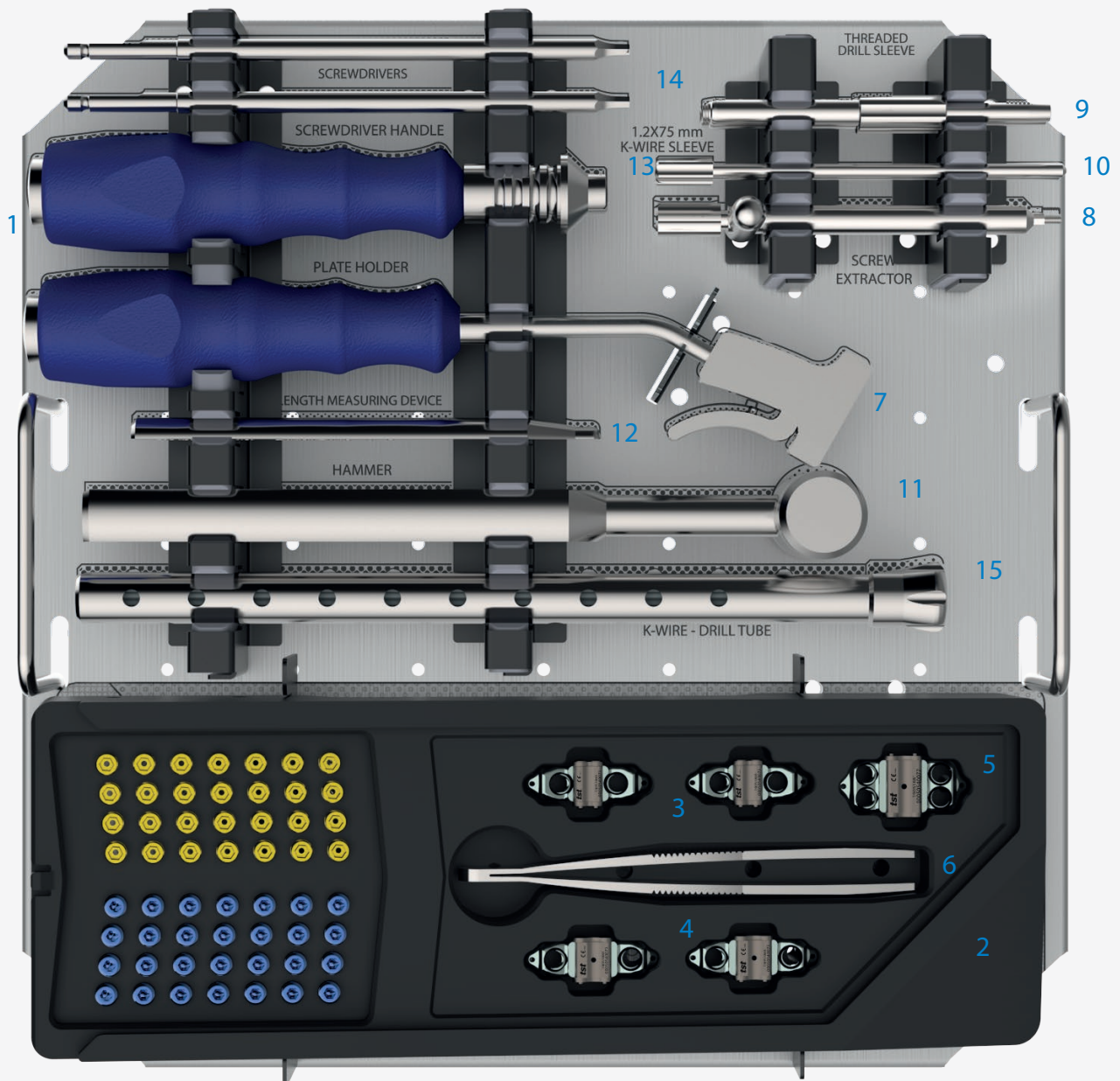
PD-10 Butterfly Growth Plates Set